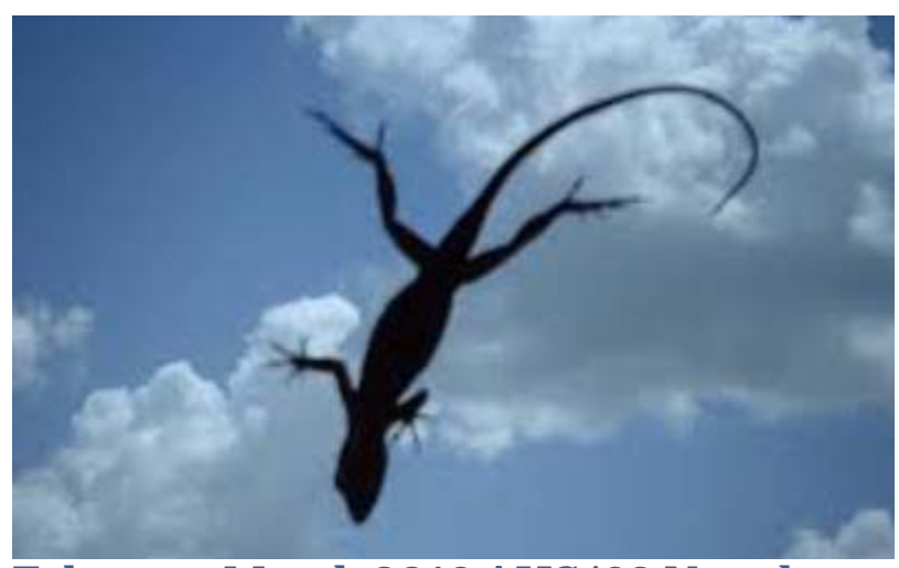
February-March 2016 AHS '63 Newsletter Lizards, Leprechauns & Brute in a Tutu

Austin, March 9, 2016. Actually, we started this little column early early on LeapDay with feverish good intentions. We were 10 ways into things that leap...and then stuff happened. Computer virus. On our Mac. These things do not occur on a Mac. It is like it's own planet. But... if you have the firewall turned off...okayokay who turned off the firewall? Sigh. Feverish good intentions went pffffft whilst somebody else controlled the cursor...5 hours and only $129 later we were clear of the monstrous insult. But, the muse refused to leap up and write...we were hobbled by goblins. Bleah.