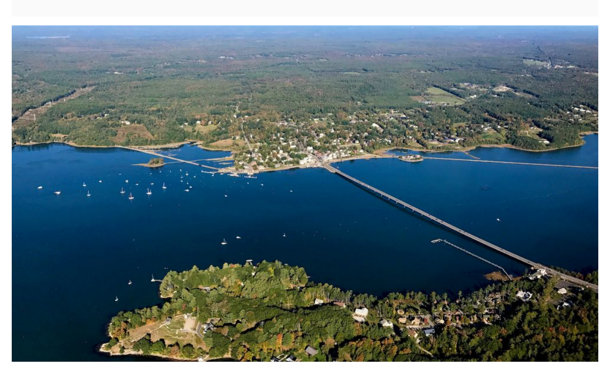
...the northern outpost