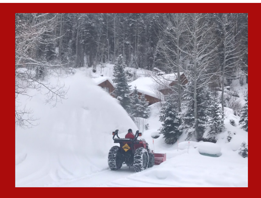
"WOW. No wonder all those people seemed older than me..." Johnny Bode

You whippersnapper ... only turning 74? We'll wait .. and we'll remember ...nyaaaa