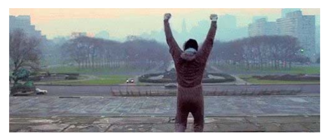
AustinHS Boys Soccer @Boys_AHS_Soccer

Austin High Baseball Retweeted AustinHS Boys Soccer Congratulations on a district championship, boys! #gomaroons Austin High Baseball added,