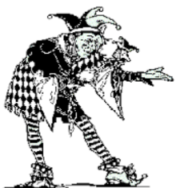
Internetty offerings of things for fools:

bizzywigs are charmed and disarmed by stupid honesty and a free box of donuts ... riddikulus! man, we've got this down and brown four ways to Sunday. smackdab down.