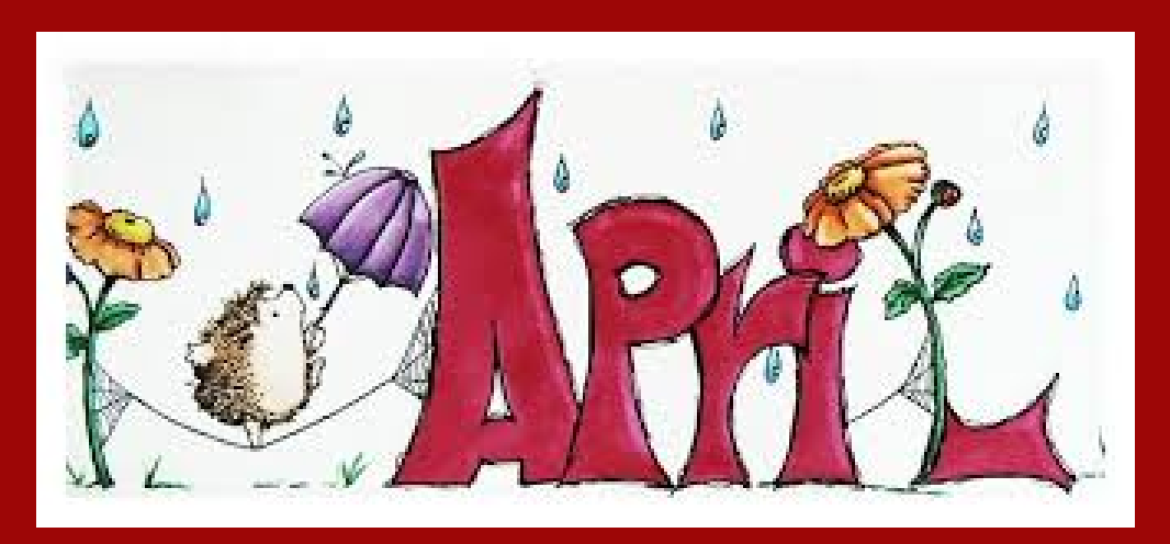
And FINALLY, the big deal you always scroll all!!!!! the way down the page for, the birthday fools of April:)