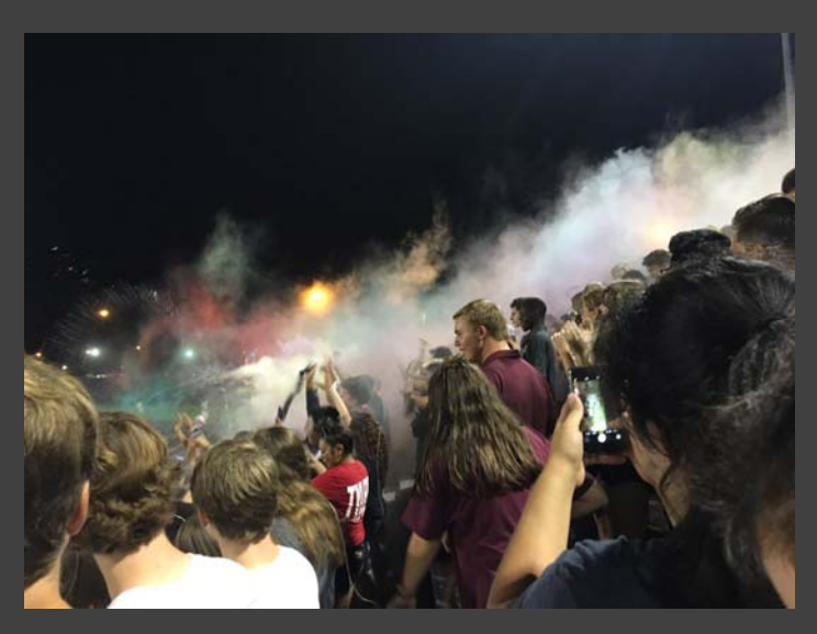
THE MAROON NEWS ROOM

In the football dept we may be 1-5 but a very cool thing just happened in the Maroon media department - there was a city-wide contest sponsored by the Travis County tax office for high schools to compete for the best a get-out-the-vote video.