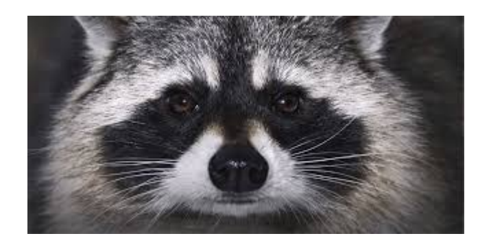
...wear your mask, wash your hands, keep your distance, behave...